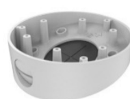
DS-1281ZJ-DM23 Inclined Base Mounting Bracket